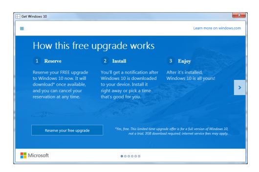
Figure 2. Example of Windows 10 Upgrade Pop-up

monthly security updates, to limit interruptions of the user experience and to appear in a contextually appropriate fashion. We further found that aggressive upgrade notifications may have pushed users to remove such notifications. As such, we suggest that a vendor could use a hybrid approach, using a balanced combination of consumer alert methods. In such a scenario, a vendor could first reduce the number of pop-up messages, which frequently annoy users. To compensate, a vendor could send emails or use social networking sites to advertise its message. Note that upgrade messaging tactics are not the focus of this work, but our participants clearly noted that this is an issue that many of them remember.